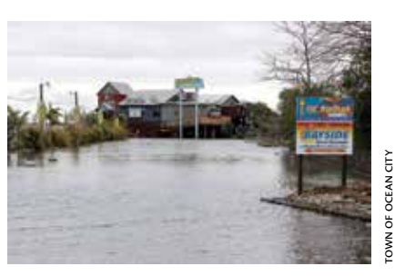
Flooding in Ocean City during Hurricane Sandy.