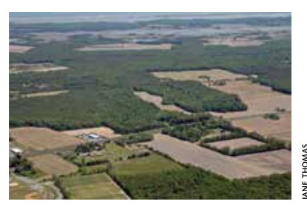
Land use in the Coastal Bays watershed affects water quality.

For the past five years, MCBP has been recruiting and hiring local high school and college students as Coastal Stewards. During this summer youth employment program, these students develop job skills and receive special training in interpretation, outreach, and natural resource restoration. Coastal Stewards are given work experience—in green jobs—conducting programs and projects at local parks, natural areas, museums, and heritage sites. Funding from EPA allowed for a crew of 15 Coastal Stewards to be hired for summers 2011, 2012, and 2013. The program, made possible with help from Assateague State Park and the National Seashore, is a model for green jobs and relevancy, diversity, and inclusion.