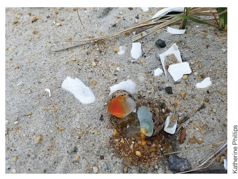
A state-endangered common tern egg broken due to human disturbance on the islands.

The islands and shallow waters of the Coastal Bays have historically provided wonderful habitat for colonial waterbirds. However, the islands are eroding at a rapid rate and more birds are squeezed into smaller areas, which causes increased predation pressure. Island restoration is more important than ever to keep the terns and skimmers on our shores.