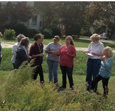
Master Gardeners surveying the Flower Street rain garden.