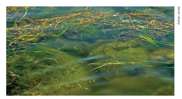
Dense floating mats of seaweed in the Maryland Coastal Bays.