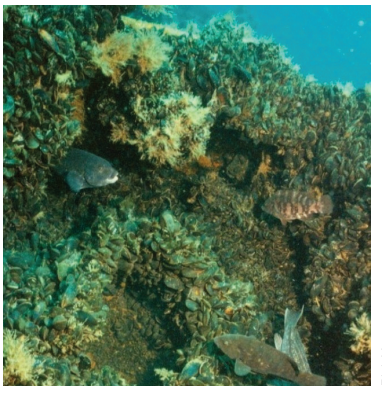
One of OCRF's artificial reefs.

Environmental Science (UMCES) annually chairs the Science and Technology Advisory Committee of the MCBP. UMCES provides communication services through the Integration & Application Network that visually presents science in the Coastal Bays Report Card and 5-year State of the Bays Report.